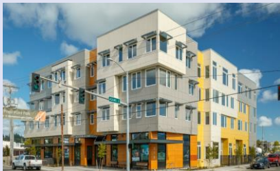
Billy Frank Jr. Place