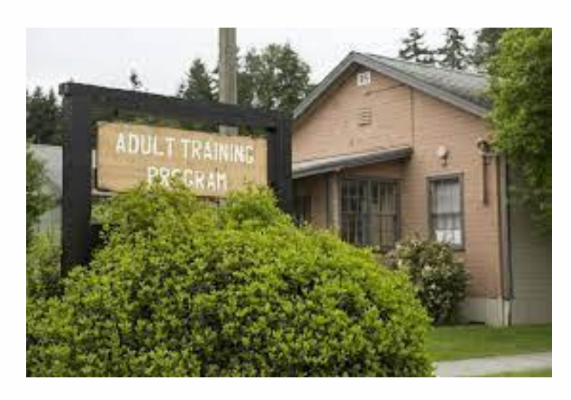
Intermediate Care Facilities for Individuals with Intellectual Disabilities (ICF/IID)

Provides individualized habilitative services to support or enhance client's individual skills and strengths