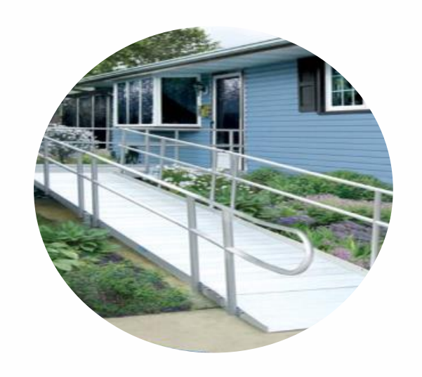
Adult Family Homes (AFH)

Long-term care settings are state licensed or certified settings that help vulnerable adults with daily living, health care, and more in: