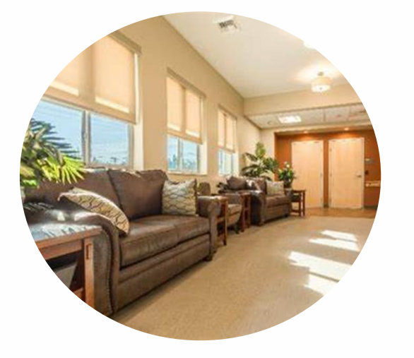
Enhanced Services Facilities (ESF)