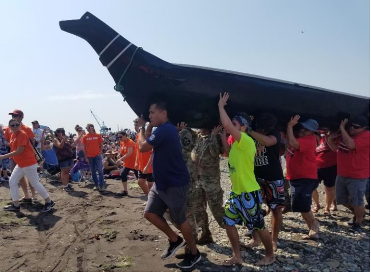
2018 Canoe Journey

Each year more than 4,600 Developmental Disabilities Administration (DDA) employees provide services and supports for more than 49,000 clients with <u>developmental and intellectual</u> <u>disabilities</u>.