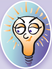
Thinking of and Comparing Solutions

Find a time when my parents and I can meet with my clinician.