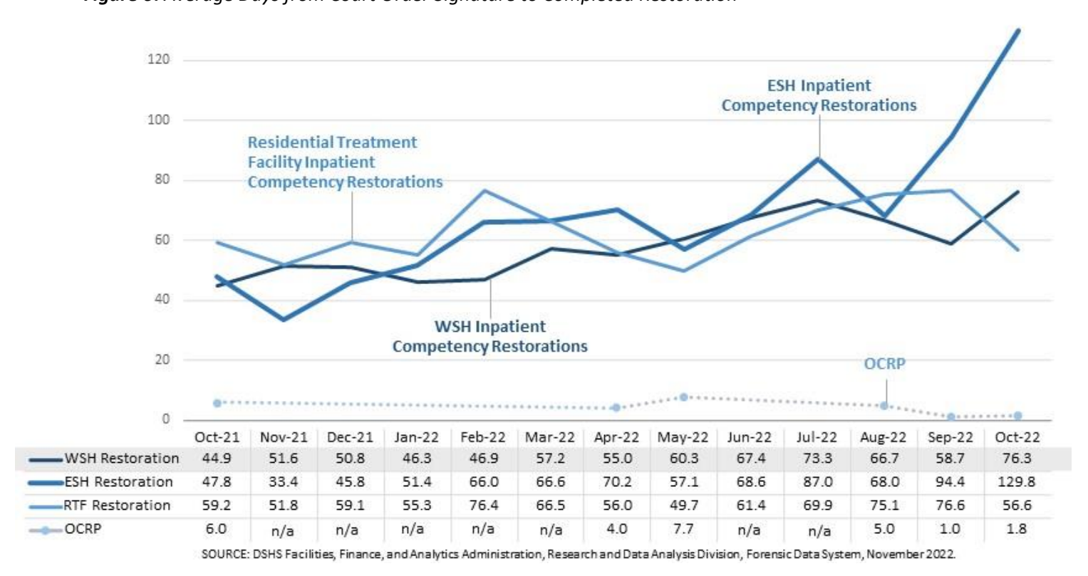
Figure 6. Average Days from Court Order Signature to Completed Restoration