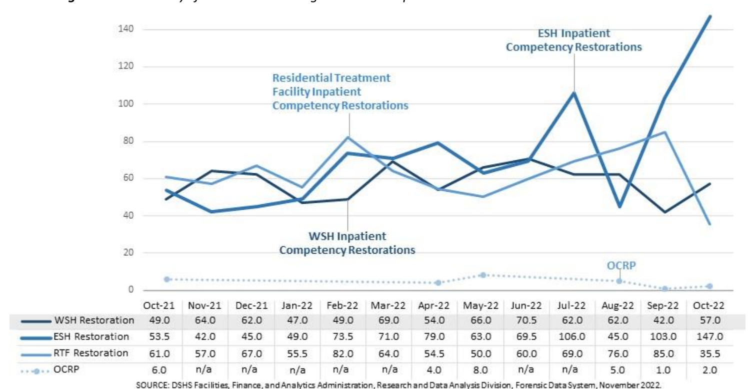
Figure 5. Median Days from Court Order Signature to Completed Restoration

Figure 6. Average Days from Court Order Signature to Completed Restoration