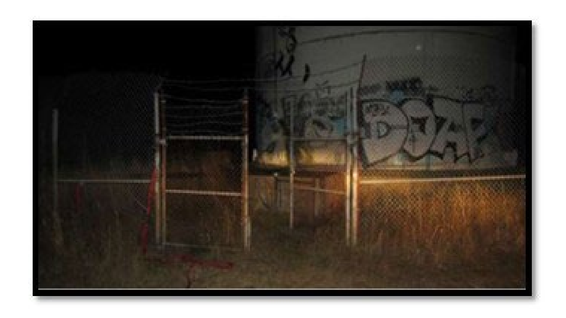
Failing exterior fence of the water tower.