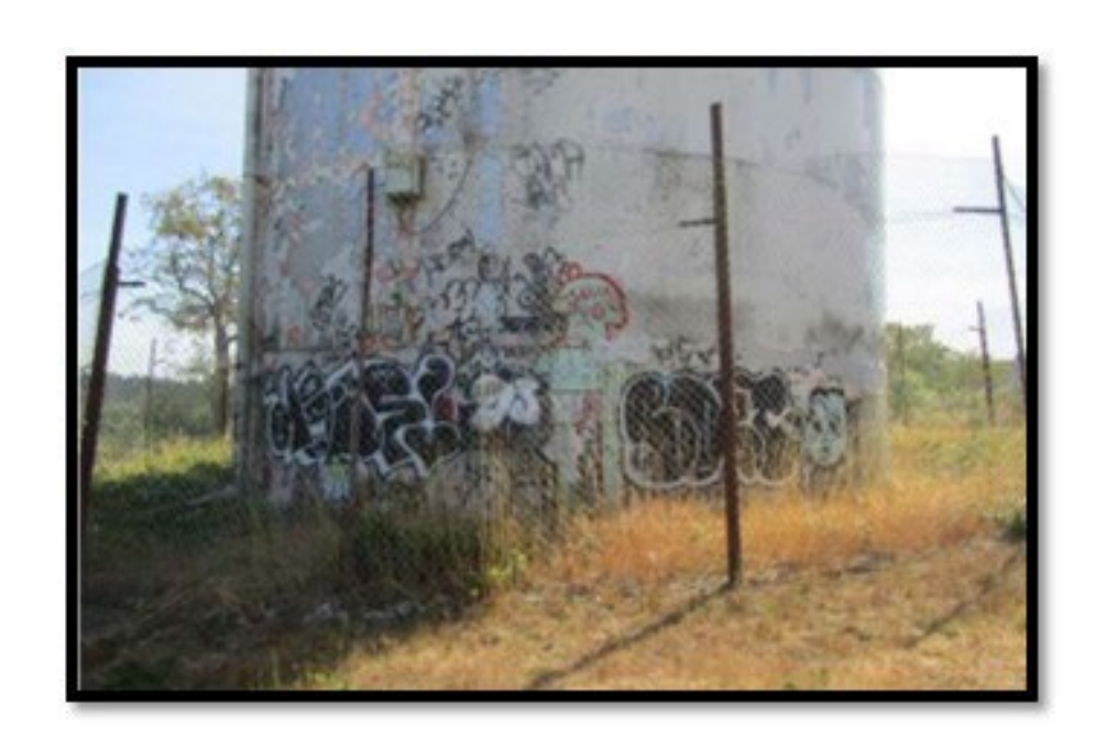
Failing exterior fence of the water tower.