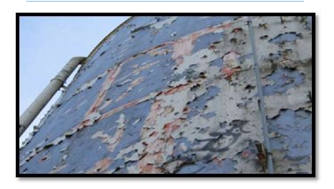
The paint is flaking off exterior of the water tower.