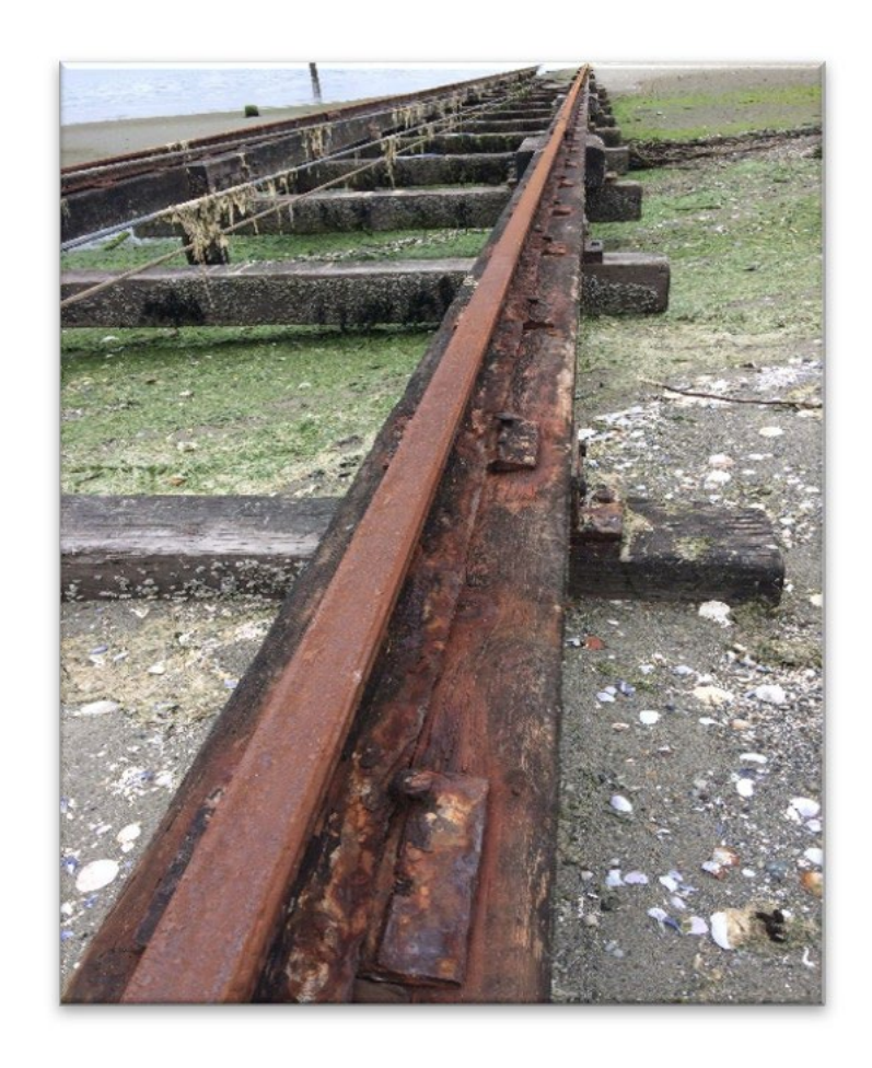
The tracks are corroded.