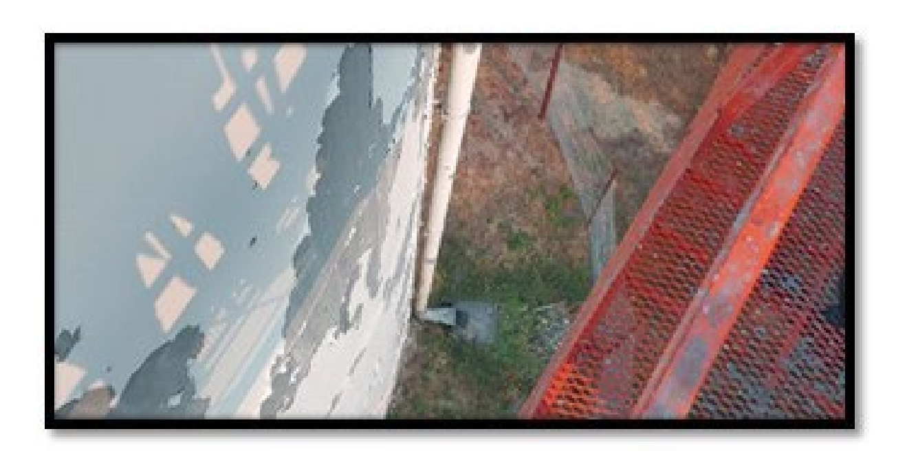
The paint is flaking off exterior of the water tower.