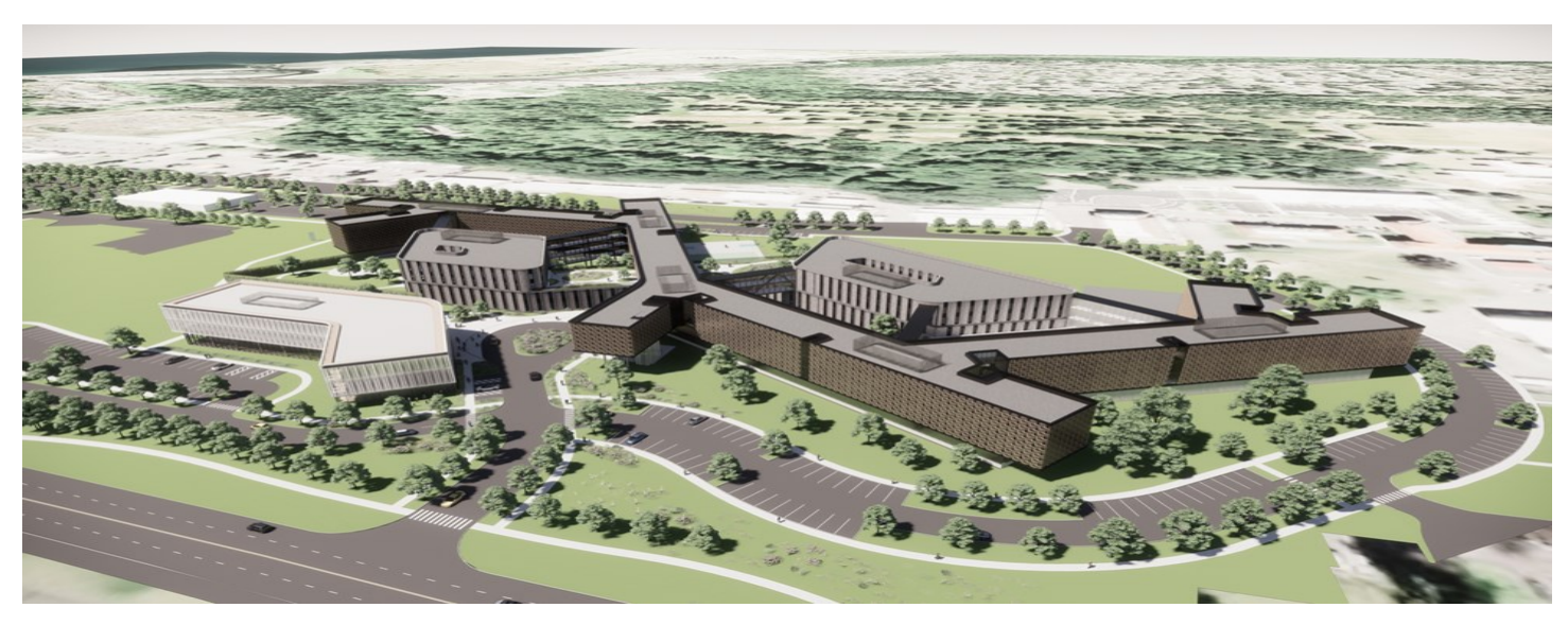
Schematic Design Concept for the New Forensic Center of Excellence at Western State Hospital - HOK