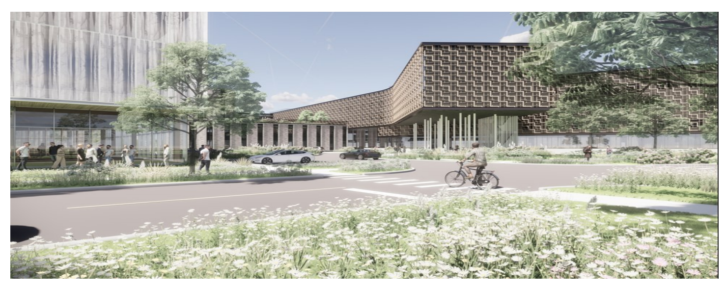
Schematic Design Concept for the New Forensic Center of Excellence at Western State Hospital - HOK