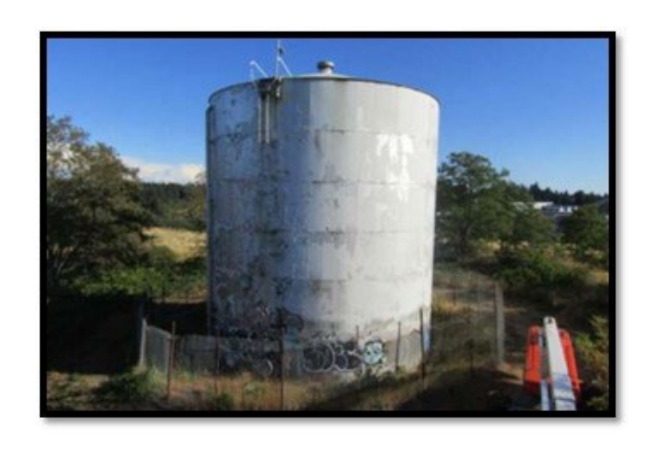
Failing exterior fence of the water tower.