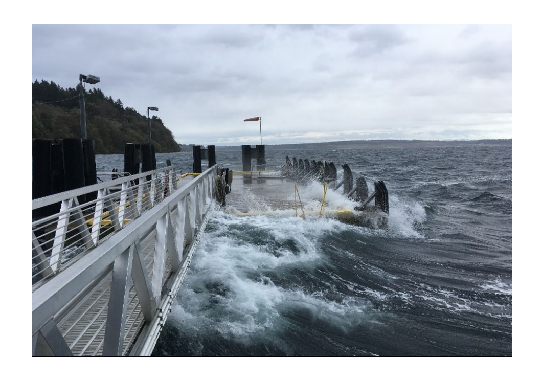
The main dock is subjected to extreme forces during rough seas.