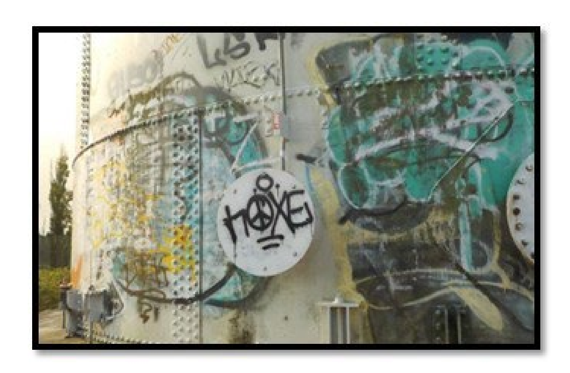
Vandalism and graffiti on water tank.