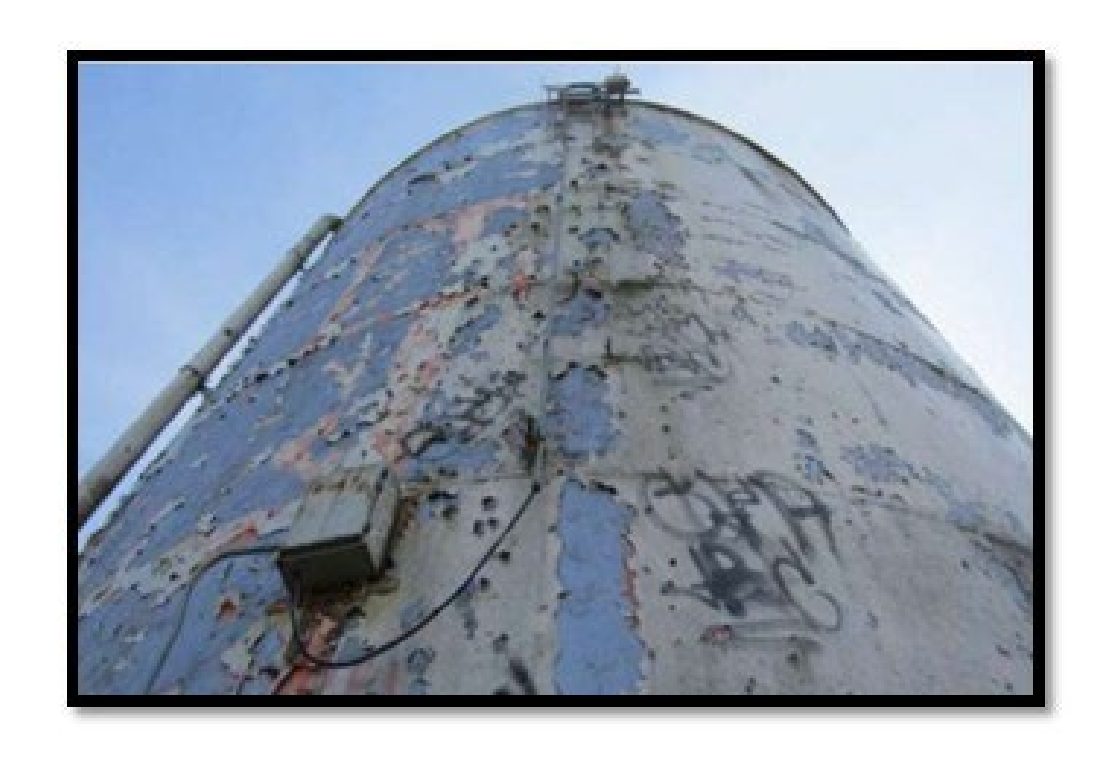
The paint is flaking off exterior of the water tower.