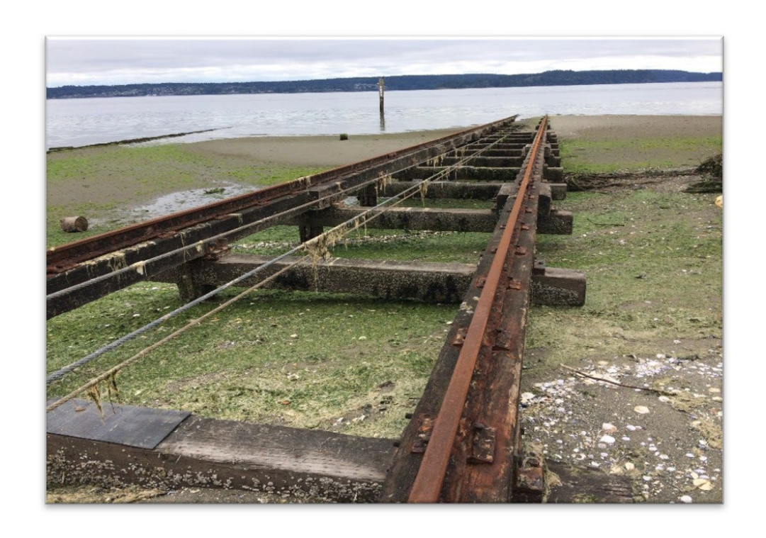
The track system which transports the ships to the dry dock.