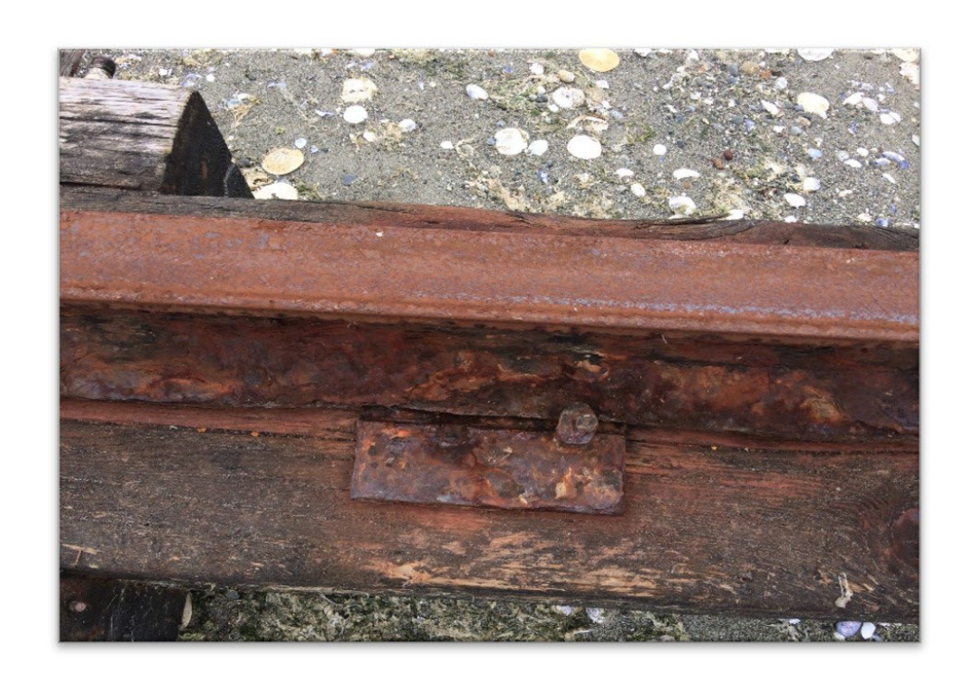
The fasteners have corroded and are failing.