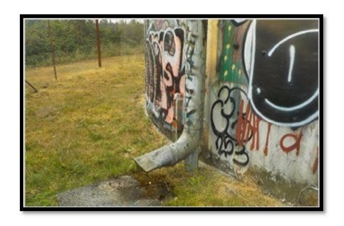
Vandalism and graffiti on water tank.