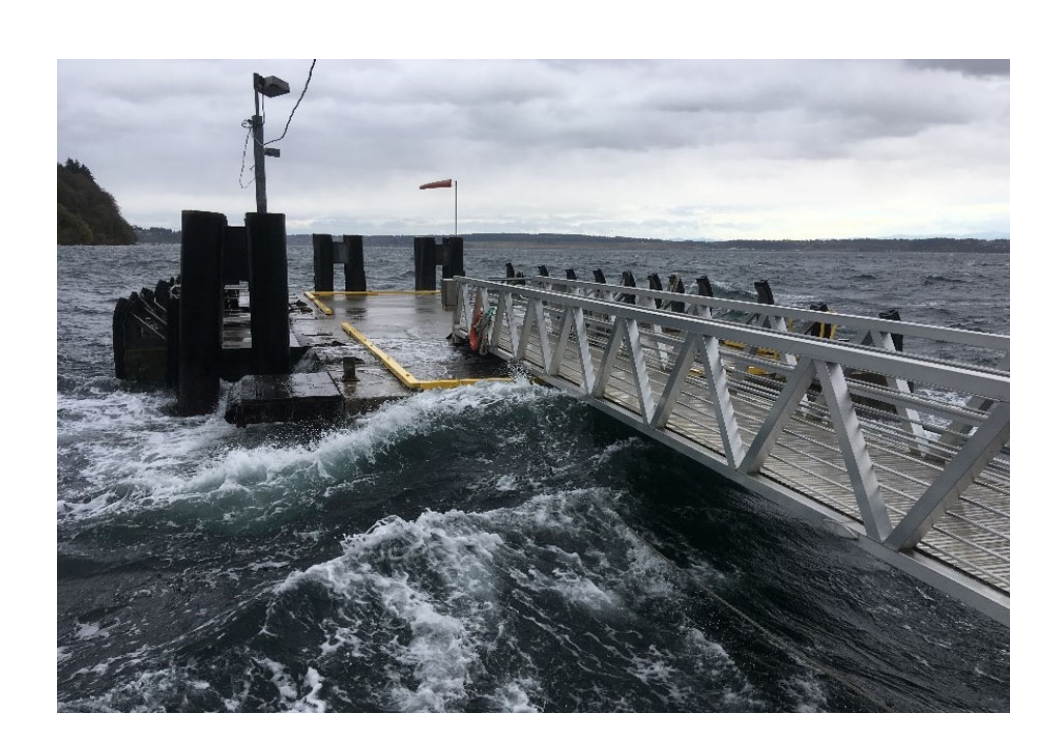
The ramp & dock can be hazardous in rough seas & inclement weather.