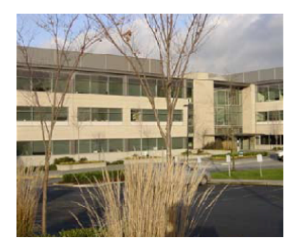
Figure 4.9: Photo Examples of Class A Offices