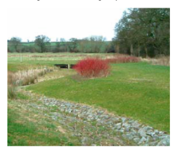
Figure 4.2: Photo Examples of Natural and Engineered Drainage Systems