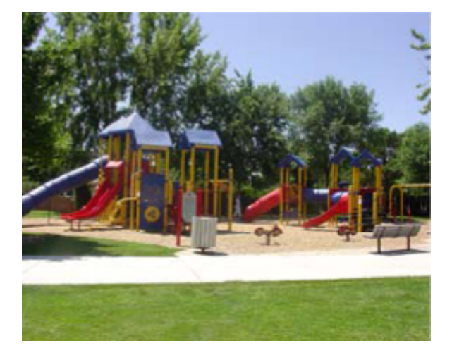
Fircrest Excess Property Report January 24, 2008