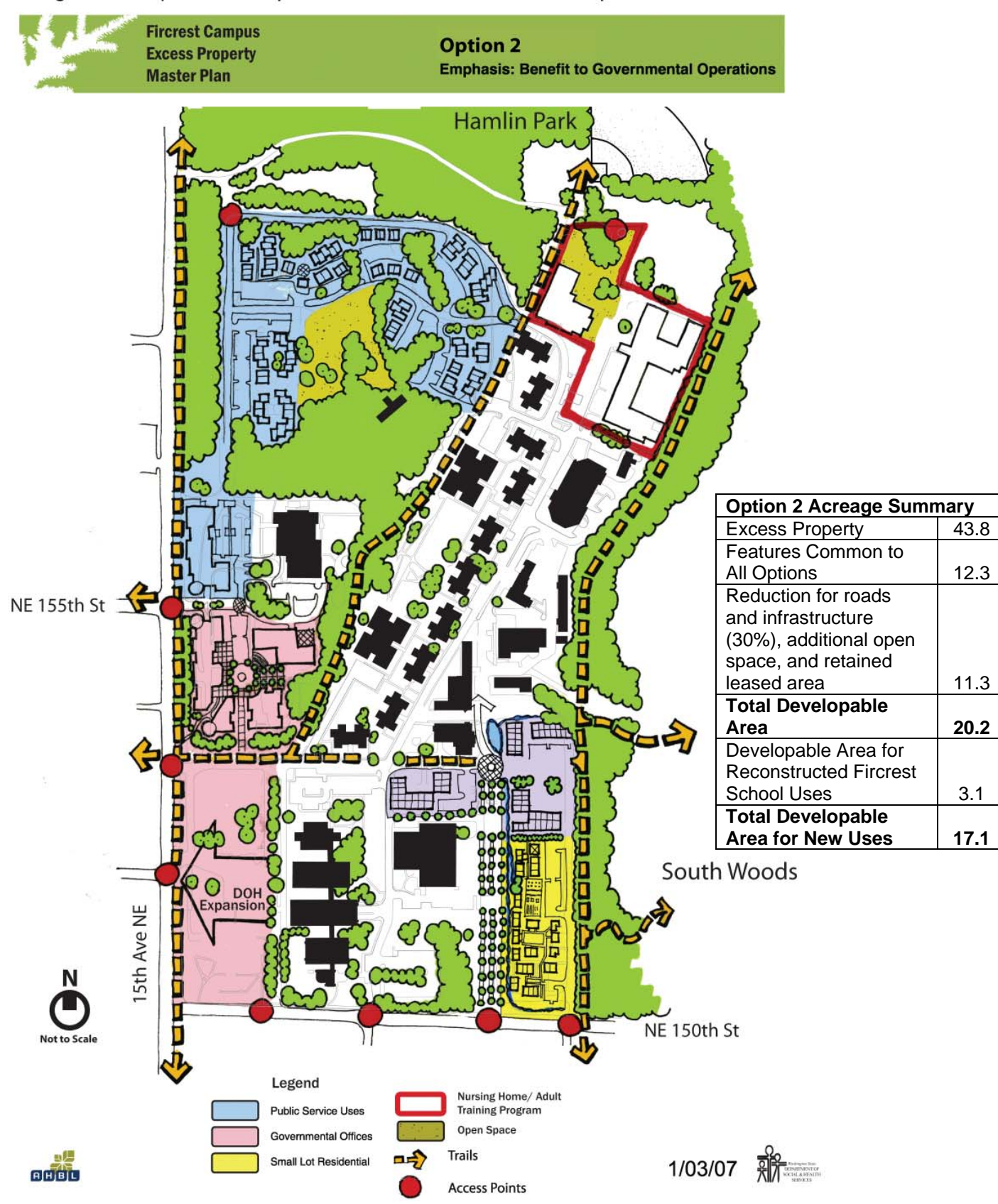
Figure 4.8: Option 2 - Emphasis: Benefit to Governmental Operations