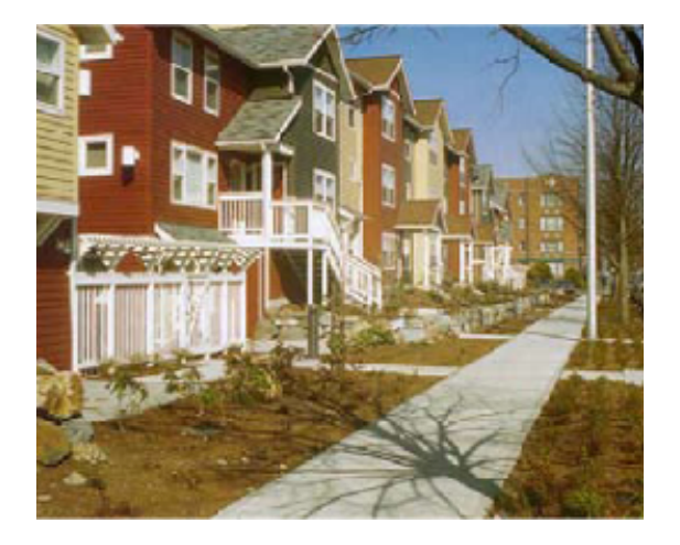
Figure 4.4: Photo Examples of Town Homes

Figure 4.5: Photo Examples of Small Lots Single-Family Detached House/Duplexes