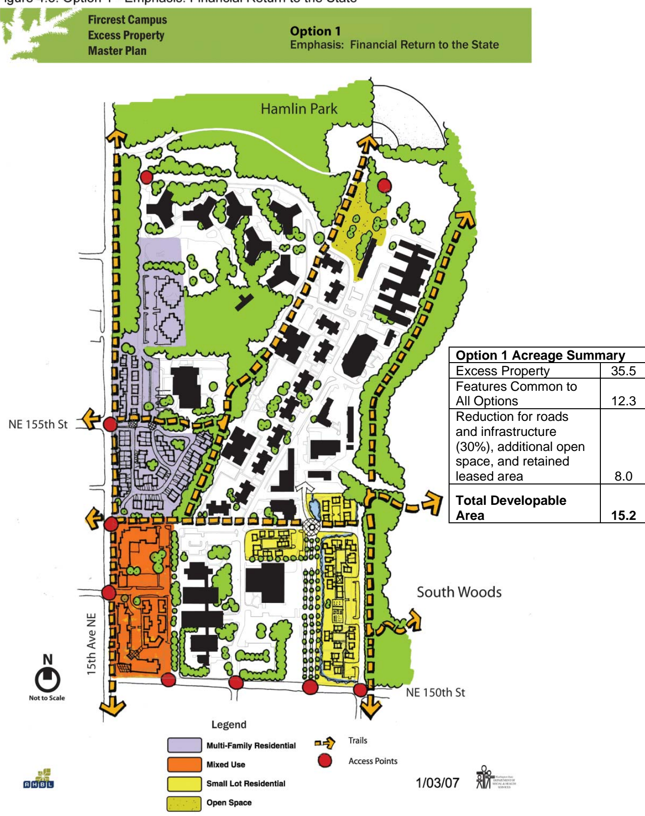
Figure 4.3: Option 1 - Emphasis: Financial Return to the State