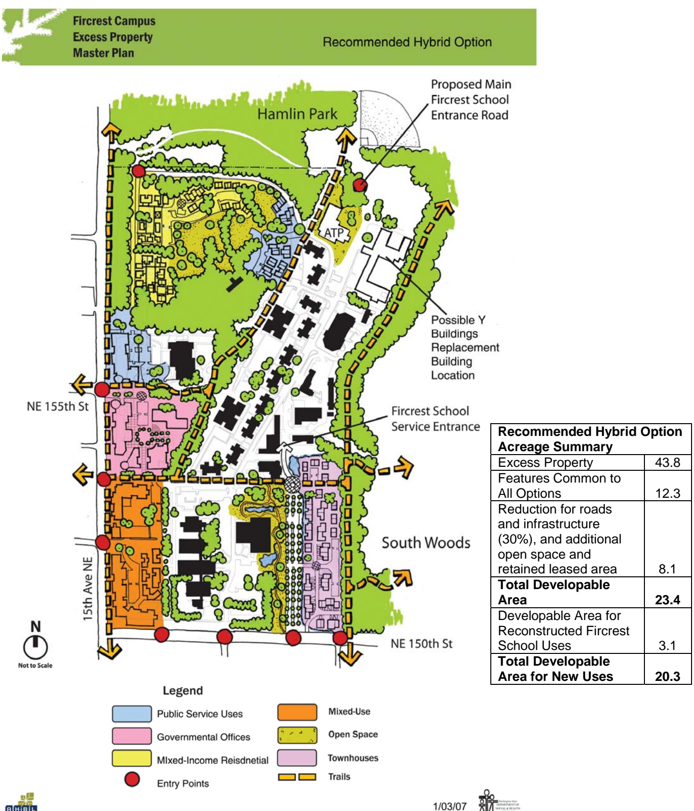
Figure 1.2 Recommended Hybrid Option