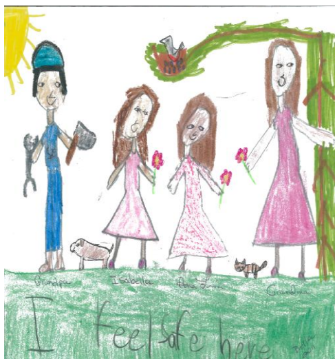
Isabella age 8 "I Feel Safe Here."

Within the Alliance, the Resource Family Training Institute (RFTI) provides training for foster, adopt and unlicensed relative caregivers statewide. Kinship caregivers are able to access all training provided through RFTI. This includes all classroom training, self-directed online workshops, and online video trainings. Some trainings have been developed which are specific to kinship caregivers.