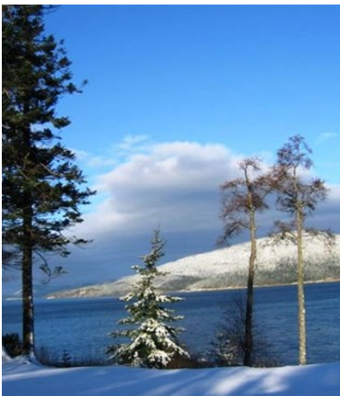
Guemes Island, WA

Centers for Disease Control and Prevention