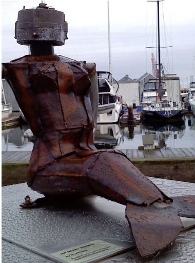
Percival Landing, Olympia

Falls are the leading cause of TBI. Rates are highest for children aged 0-4 years and for adults aged 75 and older.