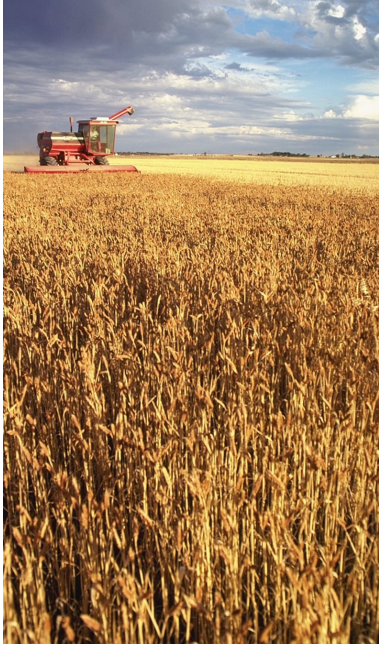
Eastern Washington Wheat

A TBI is caused by a bump, blow or jolt to the head or a penetrating head injury that disrupts the normal function of the brain.