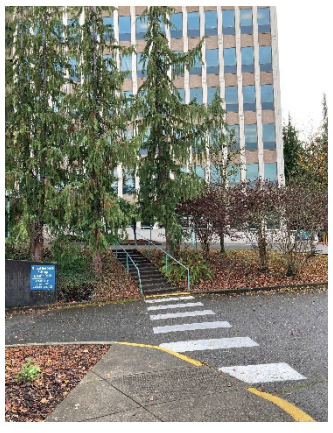
Walk up a few steps then turn left.