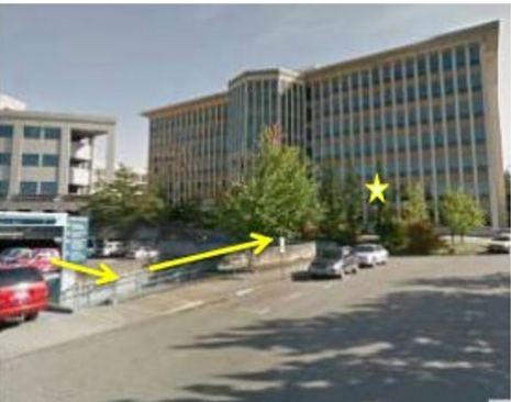
Take a left at the top of the stairs (yellow star).