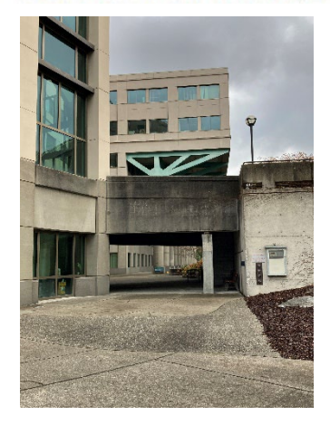
Pass under a walkway.