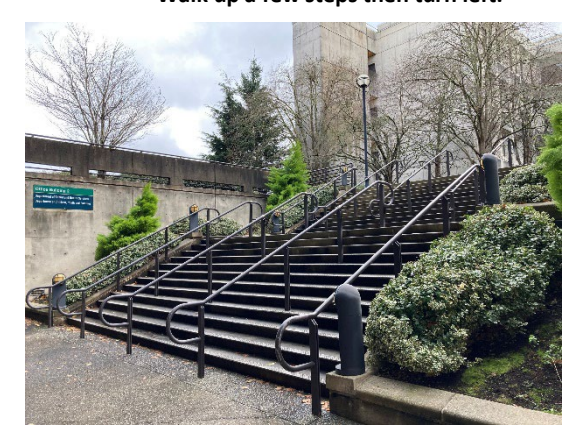
Walk up the stairs to OB2 entrance glass doors.