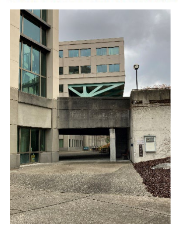
Pass under a walkway.