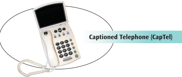
Captioned Telephone (CapTel)