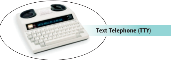
Text Telephone (TTY)