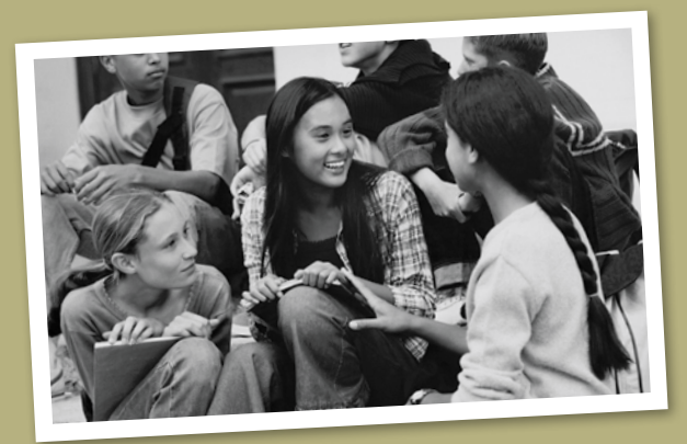
DID YOU KNOW

Remember, States' participation is mandated by the federal government.